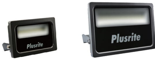
Product Dimension: (mm)