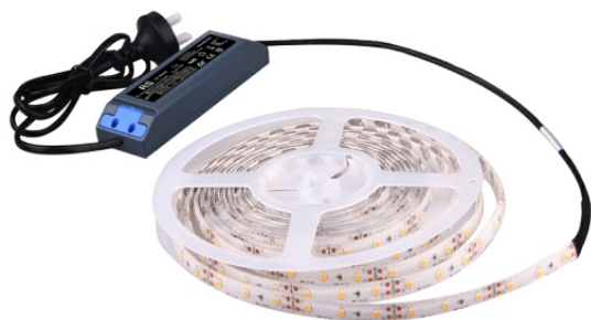
PL-S12W-3K-12V-2M PL-S12W-5K-12V-2M PL-S24W-3K-12V-5M PL-S24W-5K-12V-5M